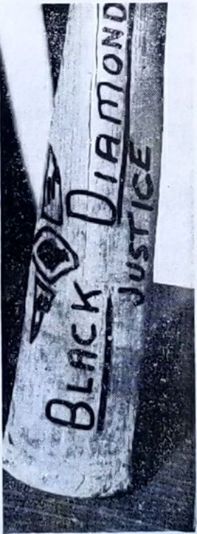
CLUB WITH MOTTO Police confiscated 20

Be assured, when you have something to sell a Star Want Ad will expose your offer to the greatest number of readers for the best in Want Ad results. To advertise