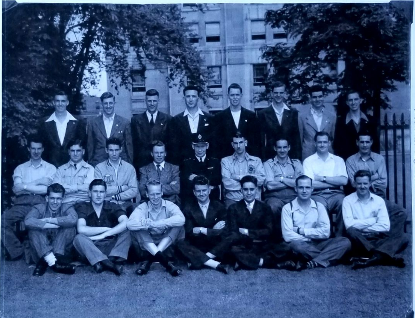
(See Next Page for Names)

TORONTO POLICE TRAINING SCHOOL JULY 14 - AUG. 23 1947