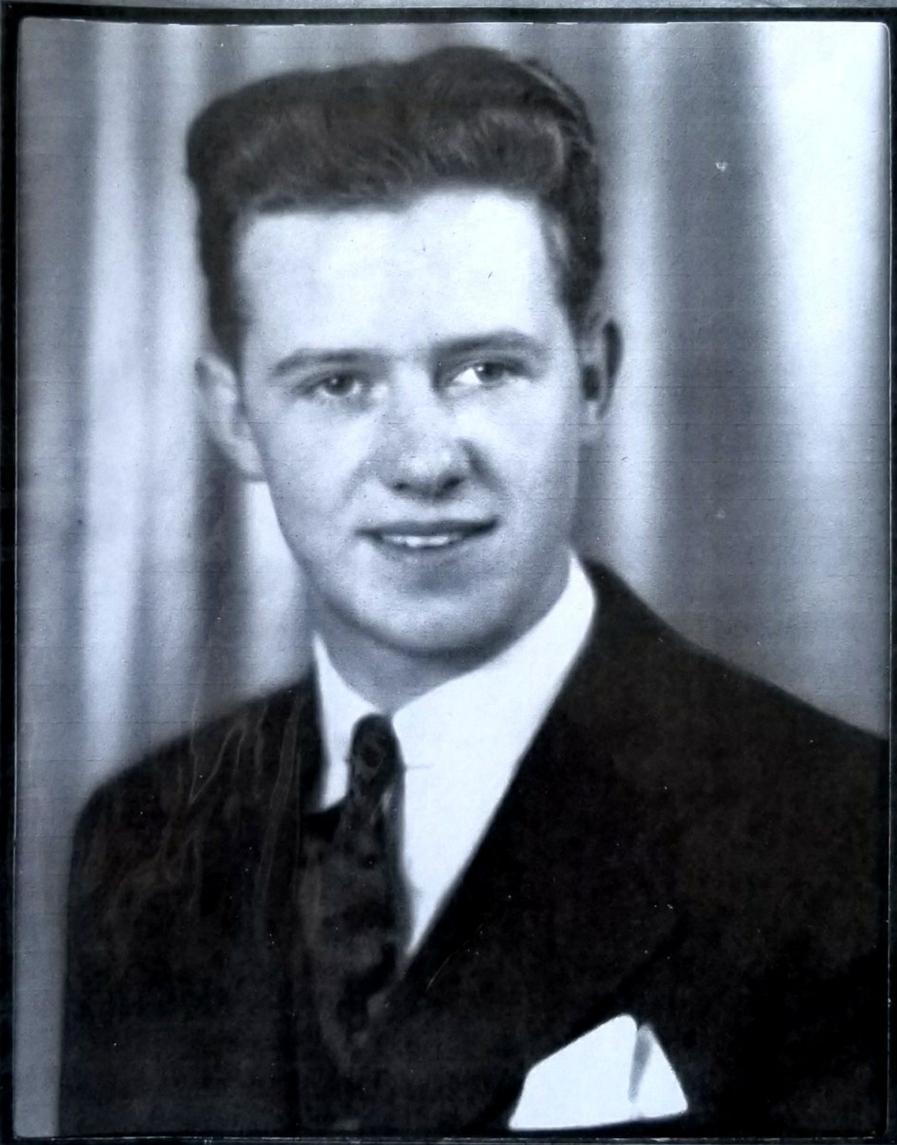
OCT. 8, 1943 - 16 YRS. & 41 DAYS CADET